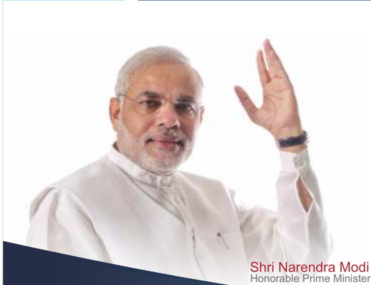
Shri Narendra Modi Honorable Prime Minister