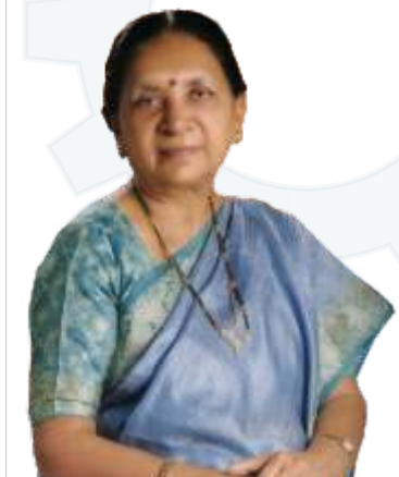
Anandiben Patel Honourable Chief Minister Gujarat