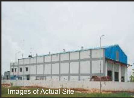
Images of Actual Site