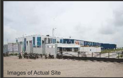
Images of Actual Site